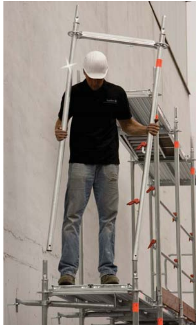
One frame, where otherwise two standards and ledger are needed

Revolutionary is the right word for the new guard rail fixture and its closing bracket, operated without any tools and markedly speeding up the assembly of guard rails. The guard rails are secured against accidentally being lifted out even when the bracket is not closed. The straight ends make them easier to withdraw from stacks.