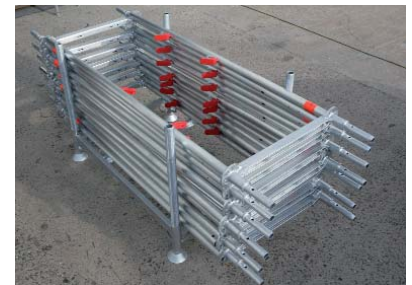
Storage and transport with tube pallet 125

Safety during transport is important to Layher too. The tube pallet 125 accepts 14 STAR frames, maintaining good order in the storage area. The STAR frames are stacked with the open ends alternately to the left and right.